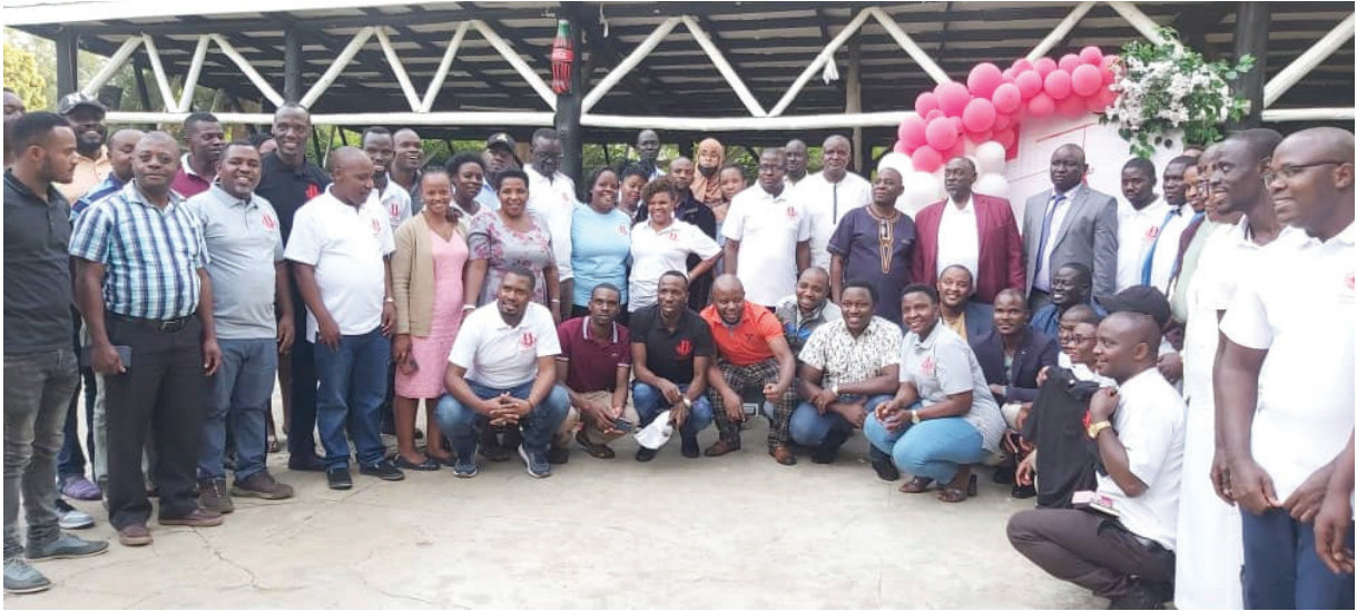
AOGU MEMBERS - WESTERN CHARTER