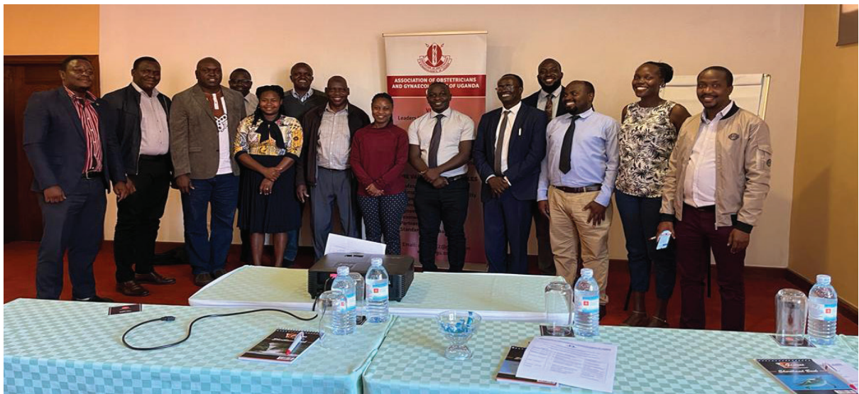
AOGU WELCOMING THE YOUNG OBS/GYNS OF 2022