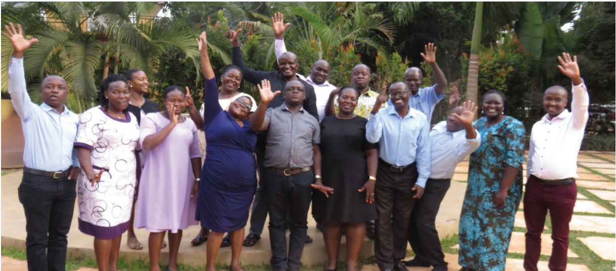
COUNCIL MEETING JULY 2023