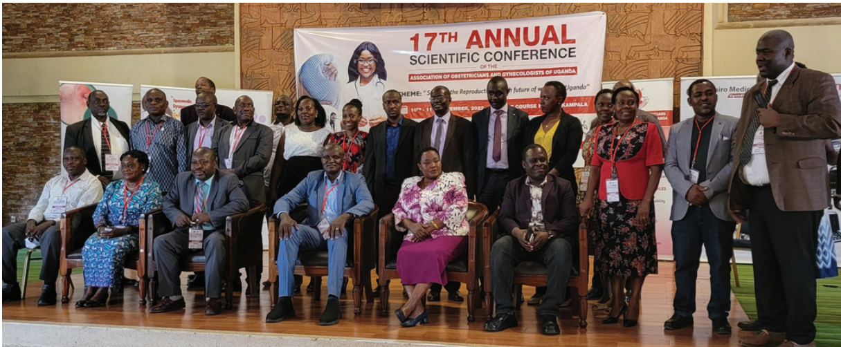
RT. HONOURABLE ROBINAH NABANJA AT THE 17 TH AOGU ANNUAL CONFERENCE GOLF COURSE HOTEL, KAMPALA, NOVEMBER 2022